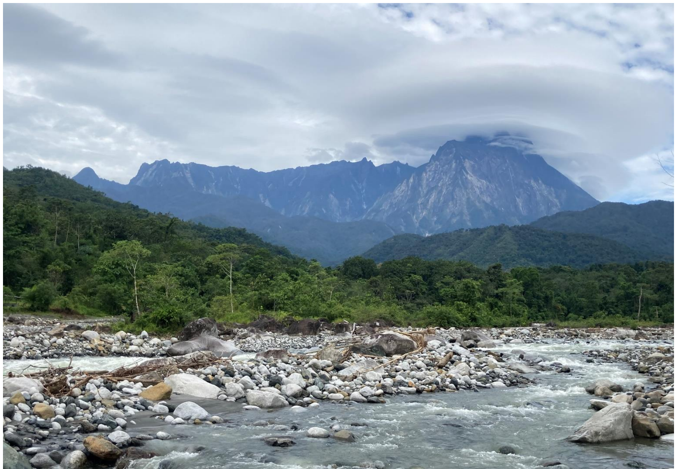
Mt. Kinabalu looking spectacular with lenticular clouds over the summit seen from close to the TMBT starting area over the weekend.