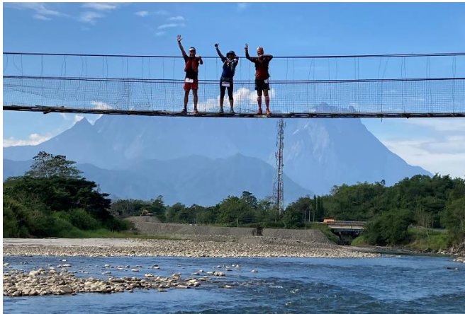
Always time to stop for a photo !!