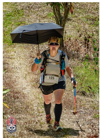
BYO shade by Chea See See.