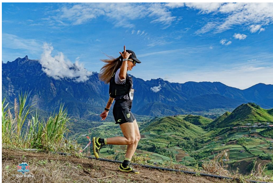
The spectacular Happy Villa view trail on the 7.5, 37 and 109k

The course maintains all the (in)famous signature trails such as the Jungle Rumble between W2 and W3, the Pineapple Ridge from W3 to W4, the Bukit Dallas trail up to the finish line for the 30k and 50k categories and the Happy Villa view hill on the 7.5k trail. We will be just past full moon for the 37k night run with a good chance of some spectacular night views to Mt. Kinabalu on a clear night.