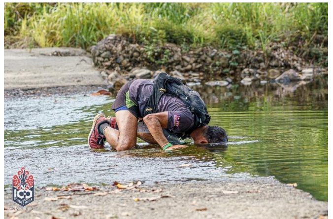
Where did that fish go?