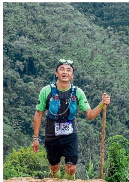
A relieved smile close to the top of Bukit Dallas on the 30k / 50k