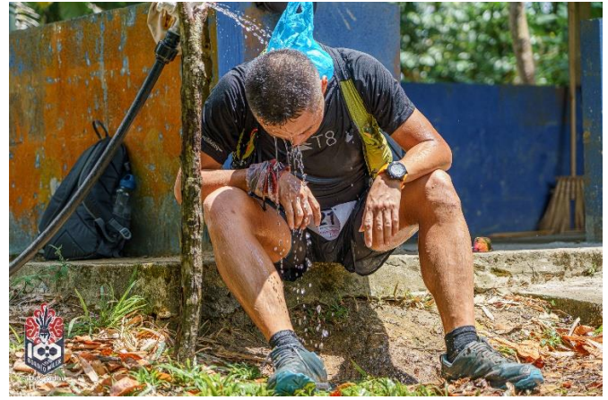
Water for life! The refreshing tap with water after Bukit Bongol was ever popular.