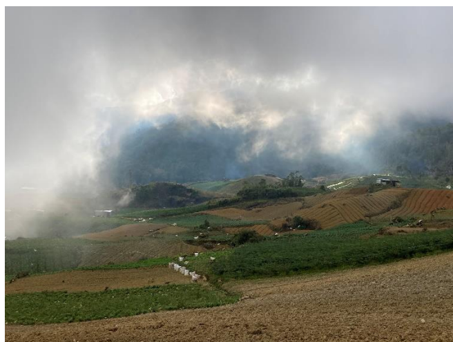
Trail checking in the cloud base up at the Mesilau vegetable patch. We will replace the most mud prone sections.

The course maintains all the (in)famous signature trails such as the Jungle Rumble between W2 and W3, the Pineapple Ridge from W3 to W4, the Bukit Dallas trail up to the finish line for the 30k and 50k categories and the Happy Villa view hill on the 7.5k trail. We will be just past full moon for the 37k night run with a good chance of some spectacular night views to Mt. Kinabalu on a clear night.